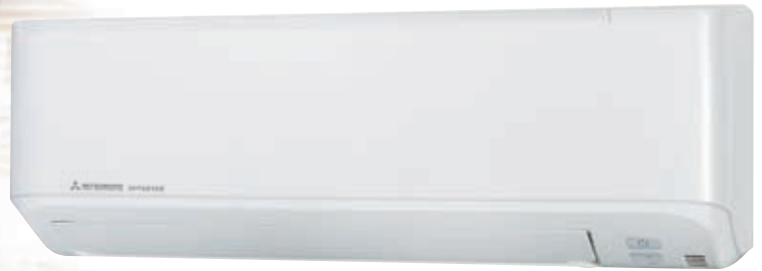
DXK09Z5-S, DXK12Z5-S DXK15Z5-S